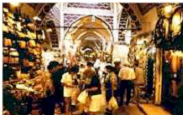
A covered bazaar in Istanbul.